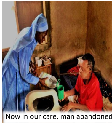
Now in our care, man abandoned to die