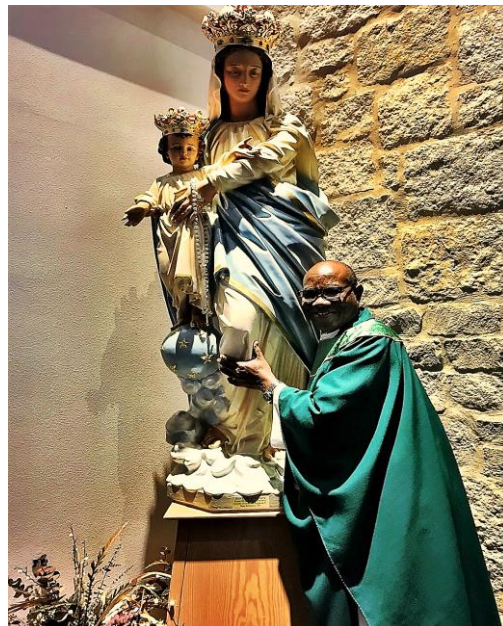
A memorial of my Golden Jubilee with Mama Mary

As you all continue with open hearts giving what you have to Christ our Lord, the Divine Face, to continue His Miracle of Compassion for the well-being of the poor and needy, may He also extend the same Miracle to your own needs. In the end may He let us all gather the overflow of our love in the inexhaustible Joy and Fulfilment of His Kingdom! Amen.