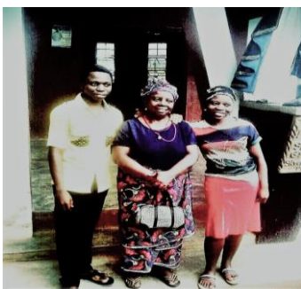
The two orphans and their mother. Both coll. graduates

Good News: Thanks to your loving support, two siblings whom we adopted from infancy together with their mother In 1993 have graduated from college. Their mother, as some of you may recall has been working in our school as cook for the boarding students. We have put another orphan into college last academic year. This year two students who were fully sponsored by you graduated from our High School. All final year students passed very well the West African Examinations Council exams for High Schools. This is the 8 th year in a row that all our students have passed those exams well! Praise God, and blessings to you their sponsors! One of them is an Aspirant in our Congregation of Stewards of Divine Face Harmony. Now that she has graduated from High School, she can go into full formation for her profession as a nun. We have put one other orphan into college last academic year. We also completed the painting of the main school building by the end of November last year. I am truly happy that we were able to reach out God's compassion to over 150 hungry and needy people during 2017 till the end of May this year when I was transferred to another parish in need (of God's spare tire). I pray we will be able to keep that Light shining in their lives! We have an abandoned sick man in our care at the Divine Face Centre. We also went a long way in installing solar power system in the Divine Face Centre to help reduce the cost of power supply using our generator.