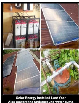
Solar Energy Installed Last Year Also powers the underground water pump