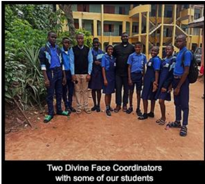
Two Divine Face Coordinators with some of our students