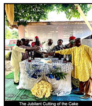
The Jubilant Cutting of the Cake

Divine Face Organization P.O Box 171343 Arlington, TX 76003-1343