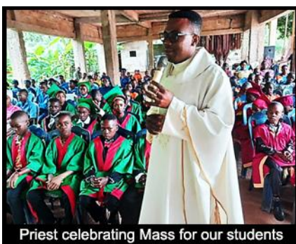
Priest celebrating Mass for our students