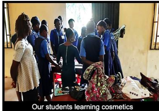
Our students learning cosmetics